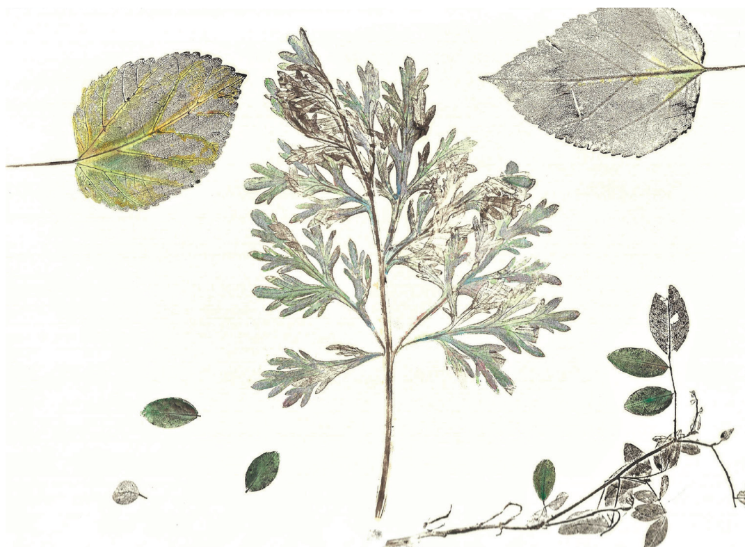
Historical reconstruction of Pastorius' plant printing methods. Top, Mulberry ( Morus nigra ); Center, Wormwood ( Artemisia absinthium ); Bottom, Rose ( Rosa ). Printed by the author at the Common Press, University of Pennsylvania, with plants from the historic collection of plants at Bartram's Garden. Pastorius grew these same species in his own garden.

In addition to his lists of plants, Pastorius described parts of his garden and its arrangement in his Beehive (a large encyclopedic notebook) and Garden Recreations poems. From these and his garden journal, we know that his garden and orchard were fenced, that he had at least two or three apiaries and outbuildings to store seeds and tools. We know that his plants were organized into different kinds of garden beds, including a nursery bed as well as beds for ornamental flowers like tulips, daffodils, a kind of exotic tuberose, and several kinds of roses. He also kept garden beds of medicinal herbs and vegetables, with many kinds of lettuce, asparagus, and root vegetables.