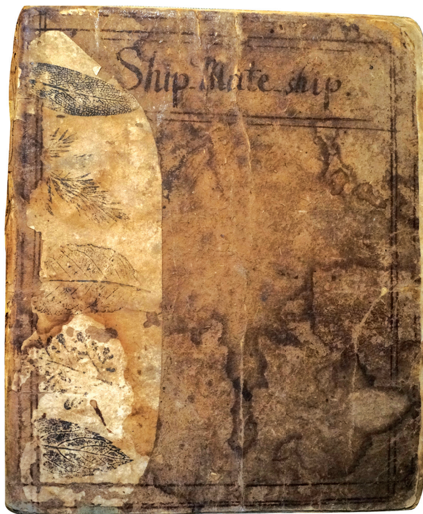
Front cover of Ship-mate-ship poetry book decorated with several nature prints by Pastorius. Historical Society of Pennsylvania, collection 0475, dated 1716–19. Top to bottom: leaf of sage, leaves of caraway ( Carum carvi ), the underside of a leaf of a woody plant from Prunus genus, blossoms and seeds of caraway, and toothed leaves of arrowhead ( Viburnum dentatum ).

plum or peach tree. This notebook is a small, pocket-sized book of about 200 pages and includes chapters about maladies common to people and domestic animals in Pennsylvania, their respective treatments and cures, and a catalog of over 150 medicinal plants, some indigenous to North America and others from Europe. Pastorius ornamented the cover with plant prints so as to celebrate the importance of medicinal knowledge to spiritual and physical health.