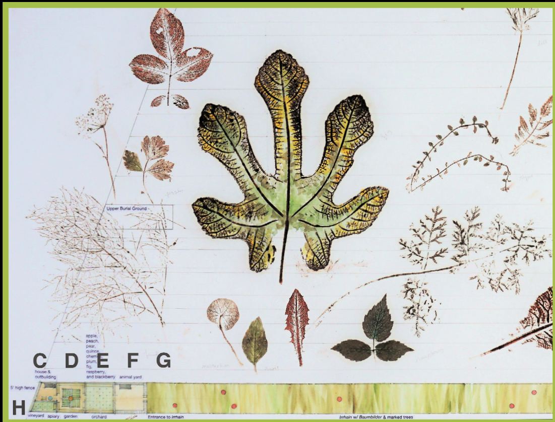
Conjectural site plan of Francis D. Pastorius and Enneke Klostermanns' town and side lots, drawn at 1"=200'-0". Shown are (C) house and hot beds for winter crops, (D) garden, (E) orchard, (F) outbuilding and yard for animals, (G) woods, and (H) vineyard and apiary. All of these parts of his garden would have been enclosed within fences or hedges. Plan and leaf prints created by Miranda Mote.

SEVERAL CITY BLOCKS separate what is today 6019 Germantown Avenue and the green space of the Awbury Arboretum. At one point, however, these nearly 40 acres in Germantown were home to the late 17th- and early 18th-century estate of scholar and lawyer Francis D. Pastorius, whose elaborate and carefully tended garden included more than 200 types of plants; different beds for medicinal herbs, vegetables, and ornamental flowers; a vineyard and an orchard; woods and fields; and beehives. The house and much of the surrounding garden have been gone for more than a century, but we can reconstruct Pastorius' beloved garden through his garden journal, poems, letters, and nature prints.